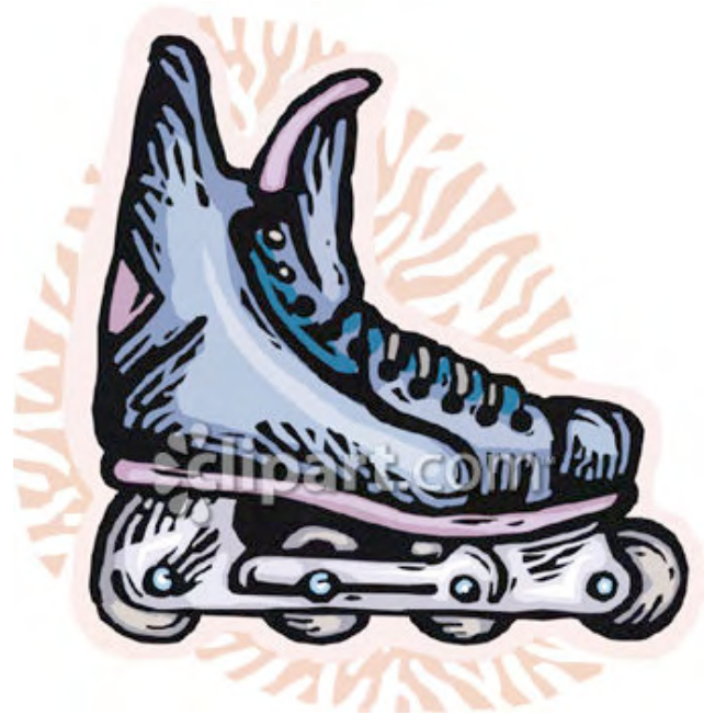
Four-wheeled inline blade

30. Rollerblades were the first commercially successful in-line roller skates. Minnesota students Scott and Brennan Olson invented them in 1980, when they were looking for a way to practice hockey during the off-season. Their design was an ice hockey boot with 3 inline wheels instead of a blade.