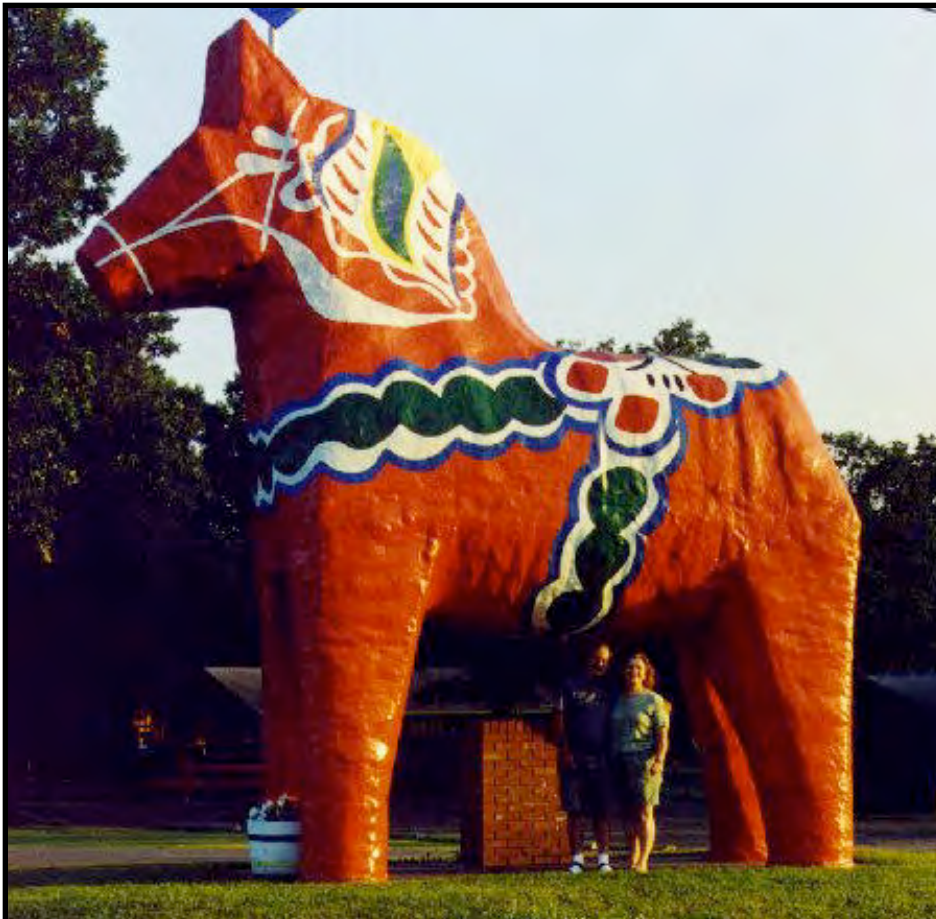
Dala Horse - a Swedish art form

50. The largest dala horse in North America is in Mora.