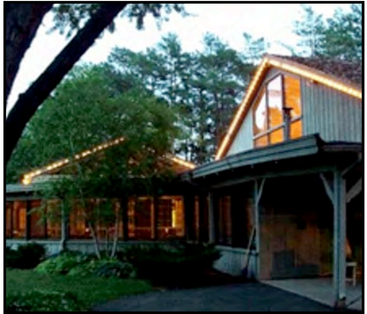
Old Log Theatre

5. Minneapolis is home to the oldest continuously running theater (Old Log Theater) and the largest dinner theater (Chanhassan Dinner Theater) in the country.