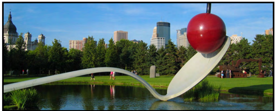
A portion of the 11 acre sculpture garden

8. The Minneapolis Sculpture Garden is the largest urban sculpture garden in the country.